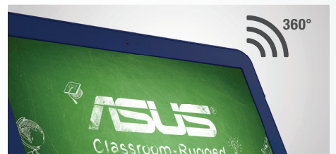
360° Wi-Fi antenna for stronger reception