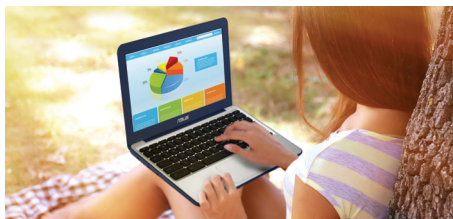
Anti-glare display great for outdoors as well