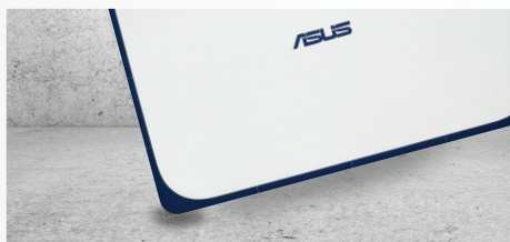
Robust, reinforced rubber wrapped protective guard