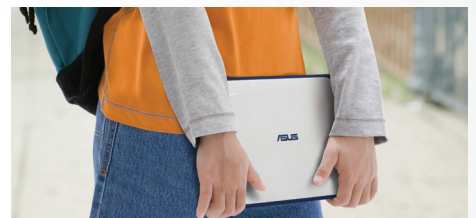
Light weight at 2.65 lbs with two grip rails for better holding traction reducing any slipping incident