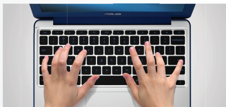
Spill-proof & 2mm travel distance keyboard